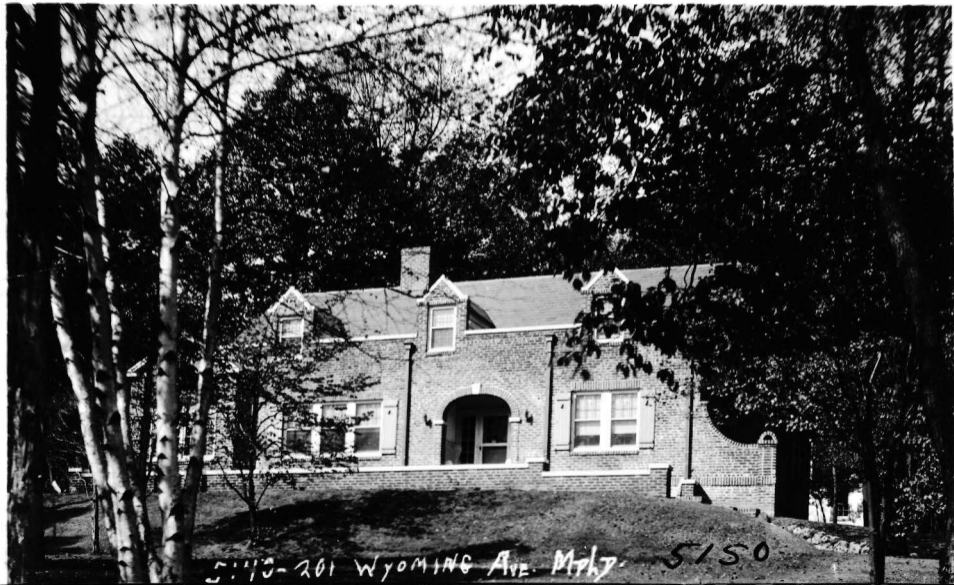
540-201 WYOMING AVE. Mth. 5150 BOARD OF REALTORS of the ORANGES & MAPLEWOOD